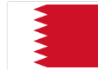
Kingdom of Bahrain