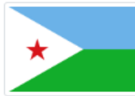
Republic of Djibouti