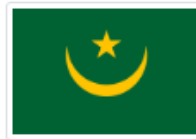
Islamic Republic of Mauritania