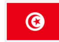
Republic of Tunisia