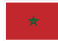
Kingdom of Morocco