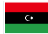
State of Libya