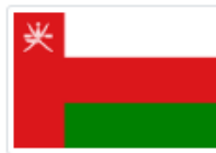
Sultanate of Oman