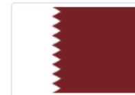
State of Qatar