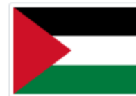
State of Palestine