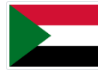
Republic of the Sudan