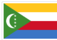
Union of the Comoros