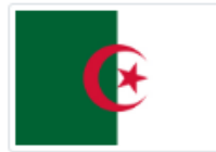
People's Democratic Republic of Algeria