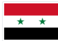
Syrian Arab Republic