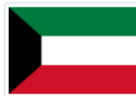
State of Kuwait