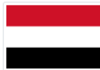
Republic of Yemen