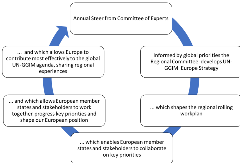
Figure 1 – Aligning the regional priorities with the global programme

It is important to note that the steer to the work of UN-GGIM: Europe comes from the global UN-GGIM programme, agreed and adopted annually at the Committee of Experts sessions in August. This ensures the work of the Regional Committee remains aligned with the global agenda while, focusing on the needs and priorities of Europe. The regional experiences from UN-GGIM: Europe are shared with the Committee of Experts closing the loop of a circular process.