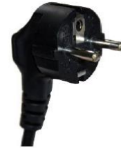
Type F: This will NOT fit

Water. We ask you to consider reducing your contribution to plastic waste by bringing your own refillable water bottle. Geneva tap water consistently rates among the highest-quality tap water in the world.