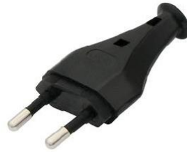
Type C: This will fit