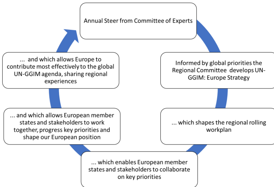
Aligning the regional priorities with the global programme

It is important to note that the steer to the work of UN-GGIM: Europe comes from the global UN-GGIM programme, agreed and adopted annually at the Committee of Experts sessions in August. This ensures the work of the Regional Committee remains aligned with the global agenda while focusing on the needs and priorities of Europe. The regional experiences from UN-GGIM: Europe are then shared with the Committee of Experts closing the loop of a circular process.