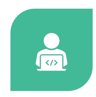
SESSION 2.2 Data and Technology Visualisation, Dissemination and Web Technologies