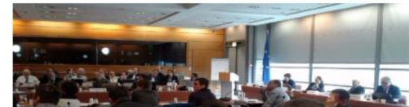
Statistical and geospatial experts hear that better data means better lives

Better data can indeed make for better lives, delegates at the second Joint Meeting of UN-GGIM: Europe and European Statistical System (ESS) have heard.